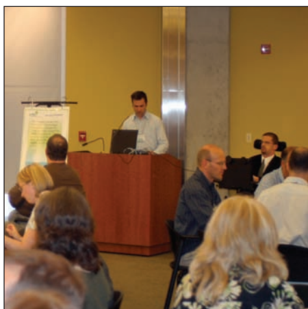
2008 Digital Odyssey