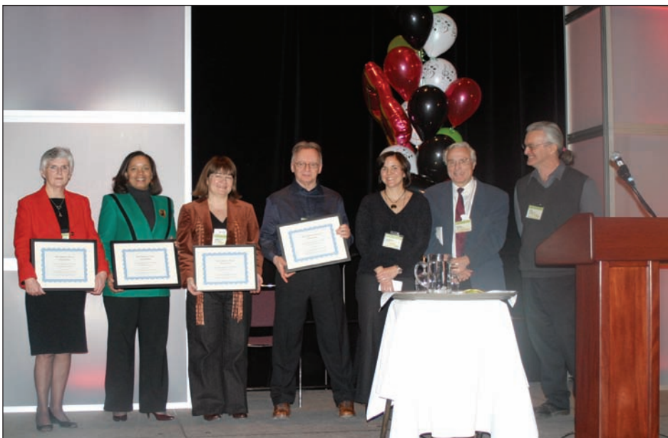
The President's Award for Exceptional Achievement went to the "Working Together" project.

The Working Together Project took inclusion to the streets. Public libraries in Vancouver, Regina, Toronto and Halifax stepped outside their walls to serve the marginalized in their communities. More significantly, they strived to