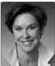
Minister of Culture

The Hon. Aileen Carroll was elected to the Ontario legislature in 2007. Carroll began her career in politics as a Barrie City councillor. She then ran federally and was elected as a member of Parliament for Barrie in 1997. She was re-elected in 2000 and again in 2004. Carroll served as