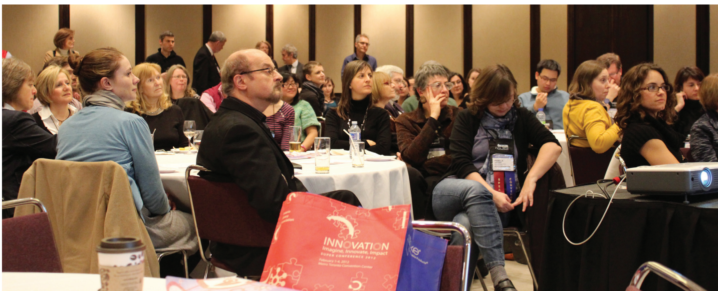
OCULA members at the Super Conference Annual General Meeting.

Enfin, le plan stratégique de l'ABO-Franco sera modifié en 2012 suivant la compilation des résultats d'un premier sondage en ligne qui a été lancé en janvier 2012 et d'un 2e sondage lancé au printemps 2012.