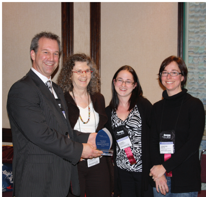
The winner of the OLITA Award for Technological Innovation: Scholars GeoPortal by Ontario Council of University Libraries.