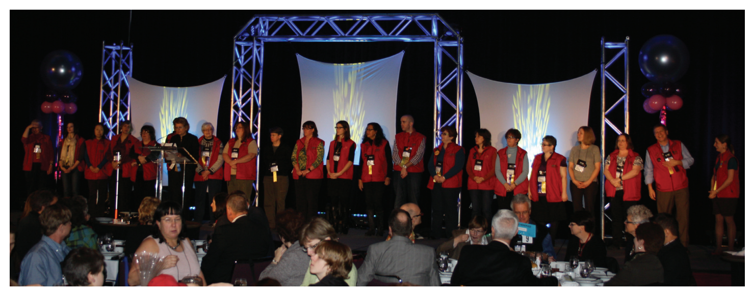
2012 Super Conference Planning Team