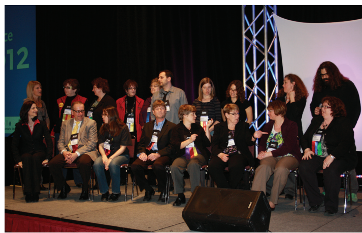
The 2011 OLA Board

As reflected in this annual report, 2011 was an exciting year for the OLA with several achievements being made. I had the privilege to work with a very strong, dynamic, insightful board. The 2011 Executive of the Board was made up of four individuals with different working experiences, expertise and backgrounds, but they shared a similarity — in being four bright, committed and