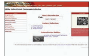
OLA Archival and Preservation Achievement Award: Whitby Public Library Archives Digitization Project