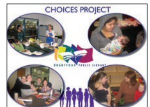
OPLA's Advocacy in Action: Excellence in Children's or Teen Services Award: Brantford Public Library Choices Project