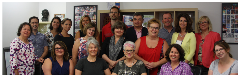
Representatives from The Partnership (2015)