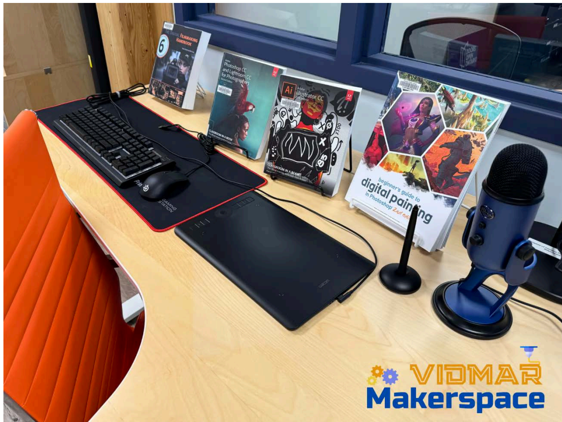
PHOTO: Digital Creation Station in the Timmins Public Library's new VIDMAR Makerspace.

The Timmins Public Library strives to be a dynamic community hub and is thrilled to soon be opening this makerspace, which will provide a welcoming environment where youth can unleash their creativity, develop new skills, and connect with like-minded peers as they discover the diverse range of equipment and technology available.