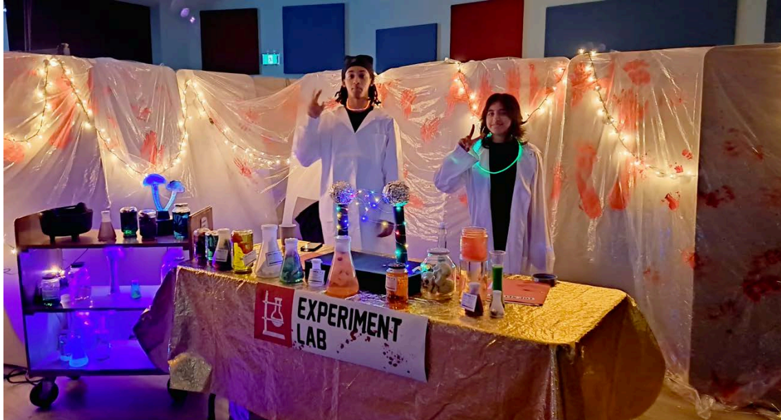
PHOTOS 1 & 2: OPL Teen Advisory Group's Haunted Lab – Scary Science!

Just in time for the spooky season, Oshawa Public Library (OPL)'s Teen Advisory Group (TAG) transformed the McLaughlin Branch auditorium into a horrifying haunted lab.