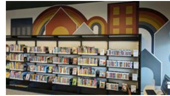
PHOTO 1: Accessible bookshelves at Stamford Centre. The sign on the back wall has been at all three previous Stamford Centre locations.