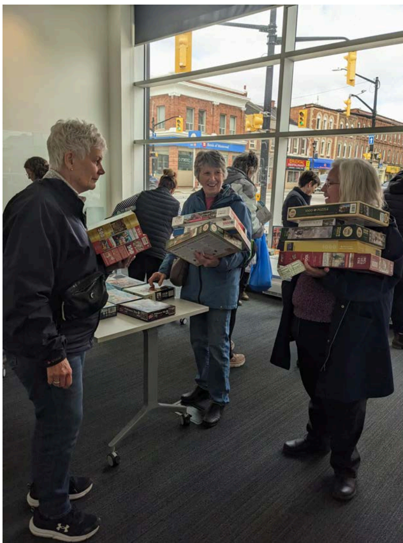
PHOTO: Armloads of puzzles were exchanged at Meaford Public Library's Puzzle Exchange event.

The Meaford Public Library (MPL) hosted its first Puzzle Exchange on Saturday, April 13, 2024, and it was a smashing success!