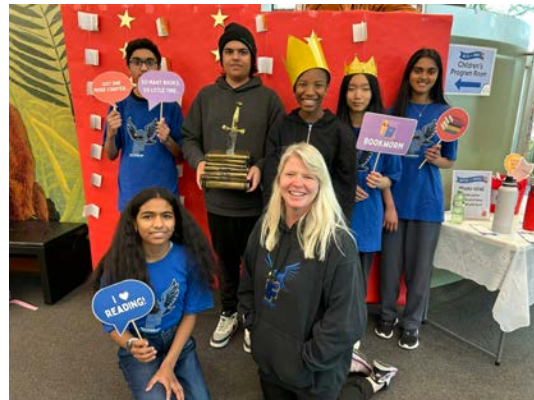
PHOTO 1: Students celebrating their win at the finals of Battle of the Books.