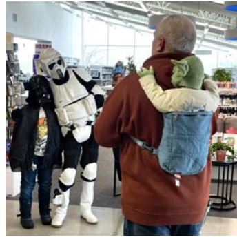
PHOTO 2: One of the Stormtroopers "engages" in friendly combat (spelling bee competition) with a library patron.