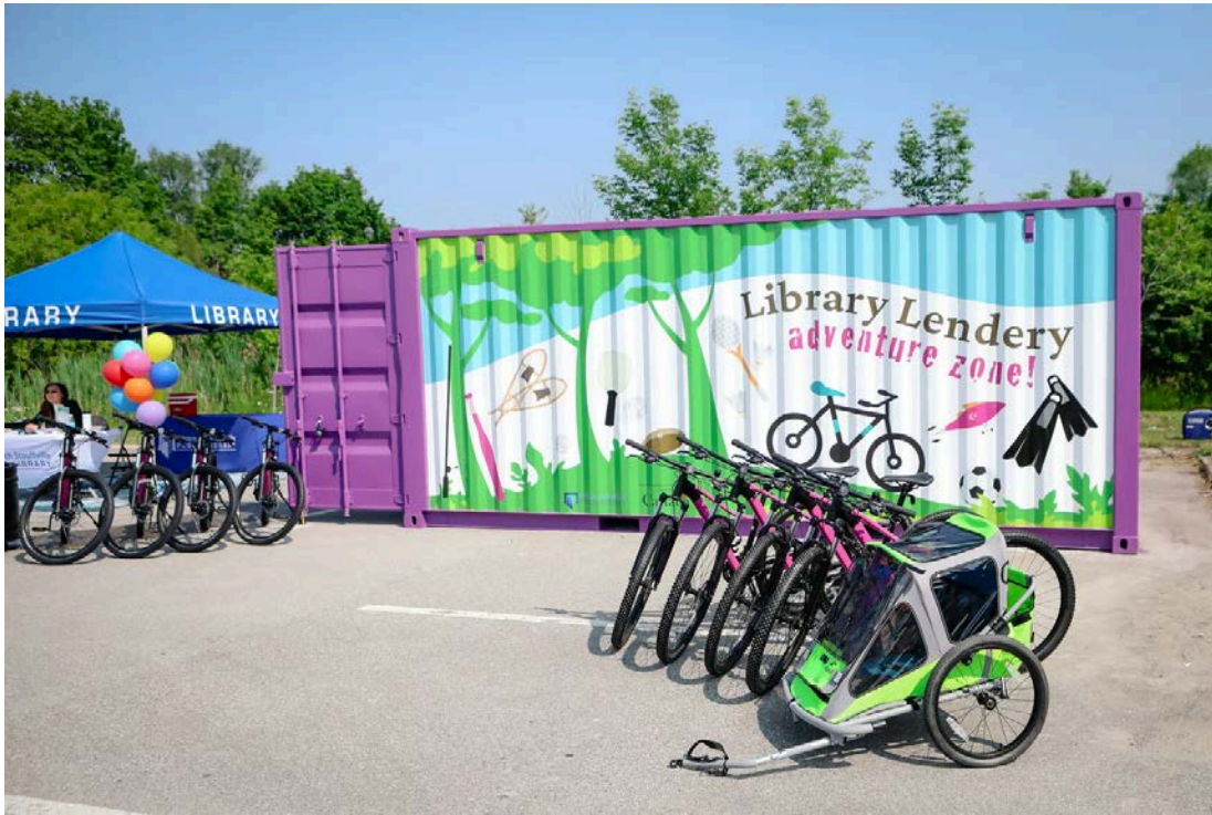
PHOTO: Whitchurch-Stouffville Public Library's Adventure Zone C-Can.

The Gold Award is presented to those entries judged to exceed the high standards of the industry's norm.