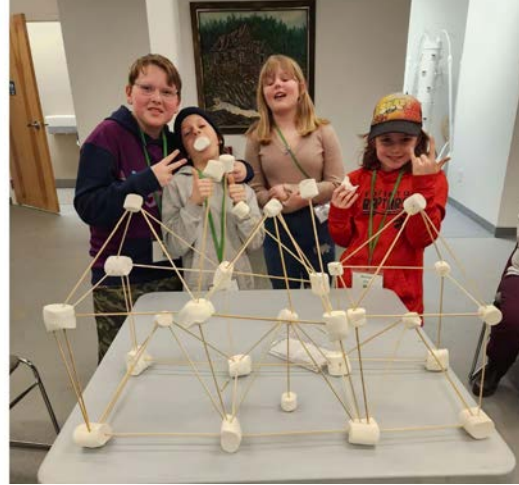
PHOTO 2: An architectural challenge with marshmallows and skewers, including a communication challenge with one person having to describe what the other should build.