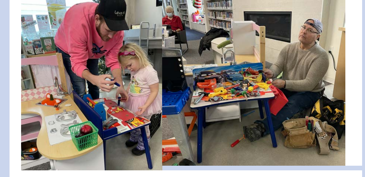
PHOTO 1: Team Leader A (in the tutu) directs her "staff" in the proper construction process for her "top secret" project.

PHOTO 2: Team Leader B does a formal check on all the tools and components to ensure that everything is in proper and safe working order for the next round of construction.