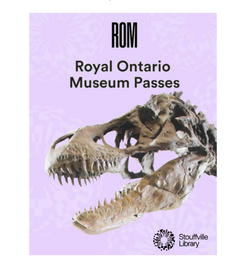
IMAGE: Stouffville Library's new ROM Pass invites families and lifelong learners to explore history, culture, and science, free of charge.

By offering ROM Passes, Stouffville Library is continuing its commitment to providing its community with more accessible learning experiences beyond books. Passes will begin to circulate to customers in mid-February 2025.